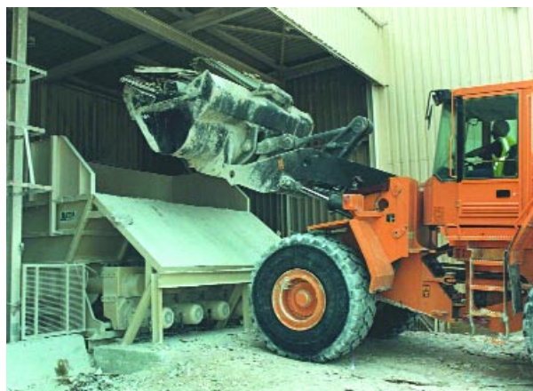
Knauf Sittingbourne Recycling Plant