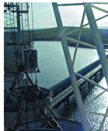
The Knauf Docking Facility at Sittingbourne