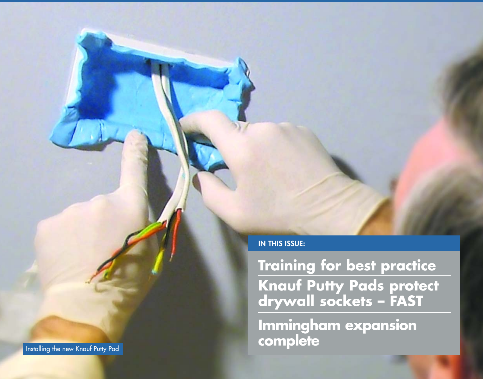
Installing the new Knauf Putty Pad